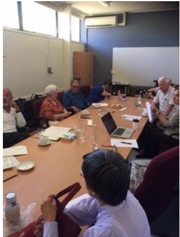
Lunchtime Forums committee in action

The information below summarises the dangers posed but members are strongly urged to visit http://www.scamwatch.gov.au for more valuable information about scams. Members can also subscribe to Scamwatch radar alerts to get up-to-date warnings about the latest scams.